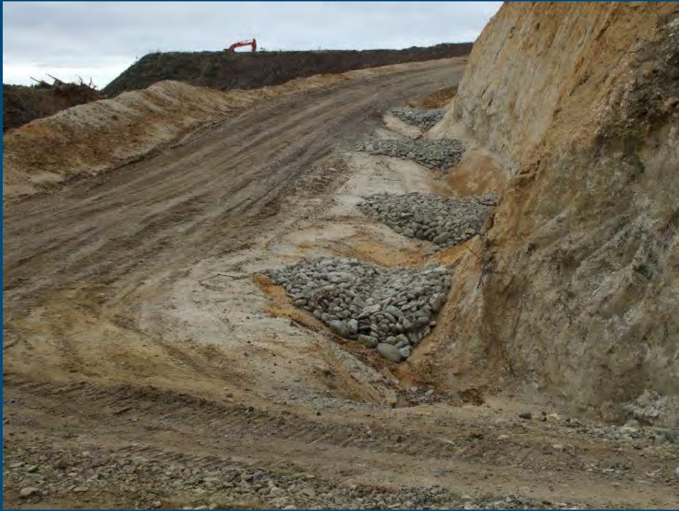
Water Table Scour Protection