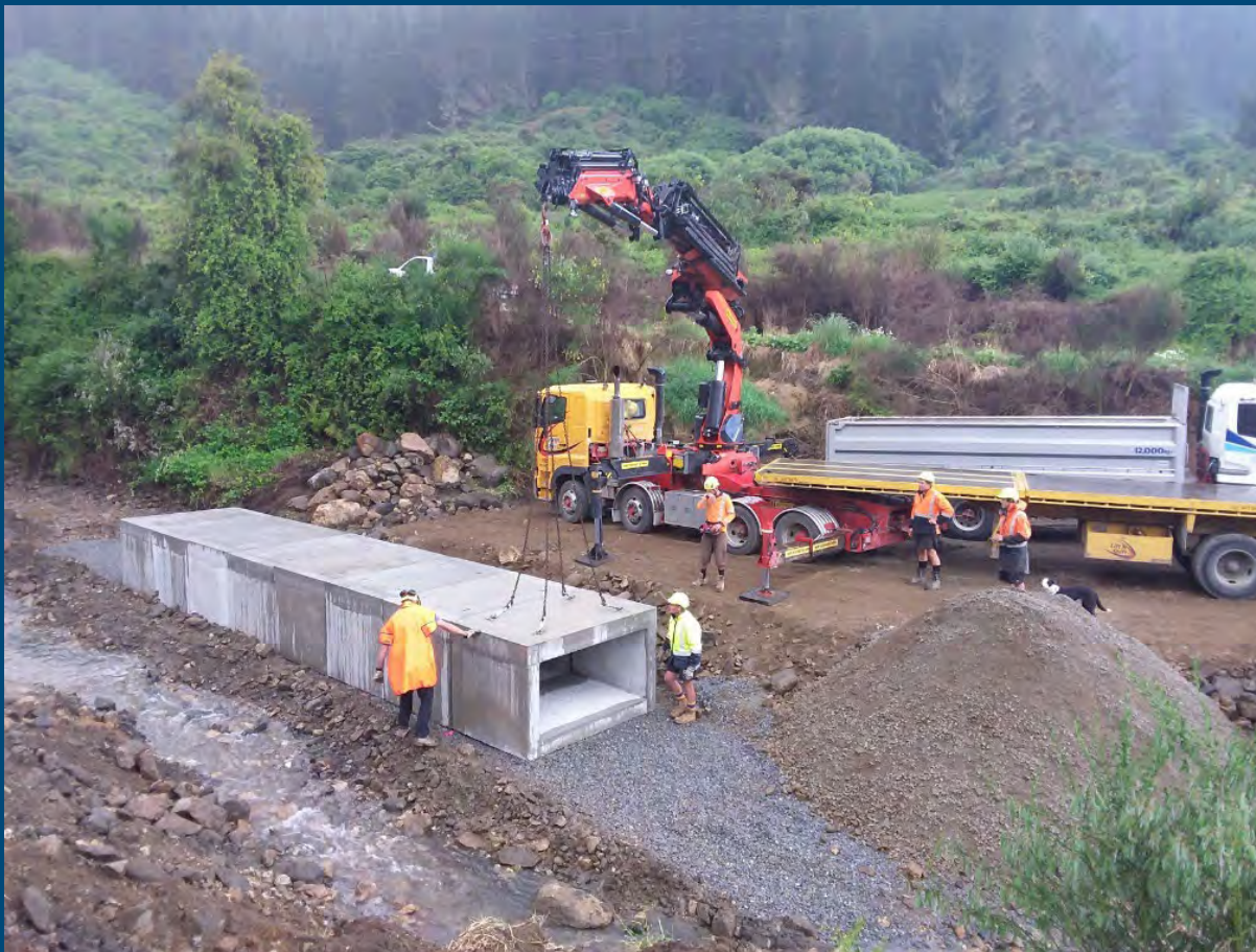
Relocatable Box Culvert Placement.