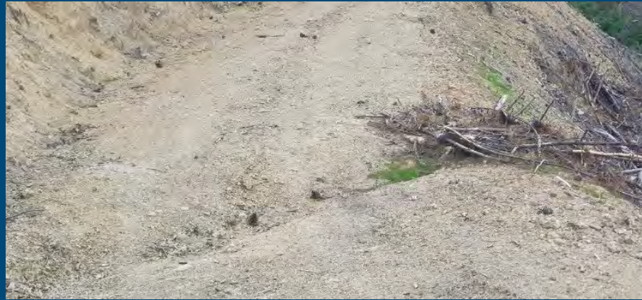
Fine Slash Soil Cover Protection